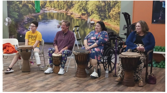
African Drumming Class

Fun Activities are the 1st & 4th Tuesdays at 6:30pm ~ All Classes are Free to Amputees!