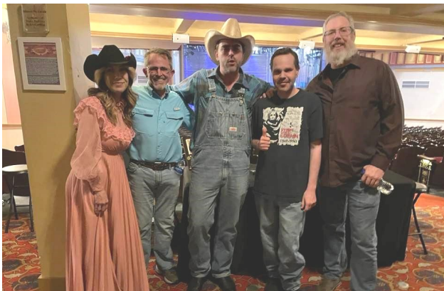
Amputee Activity: Sierra Ferrell Concert at the People's Bank Theater in Marietta in April 2022

Please Check our Facebook Page for 2023 Events & Activities!!