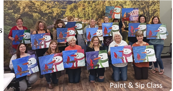
Paint & Sip Class

From African drumming to cookie decorating, our community classes were certainly a hit this year! Members of the community were able to attend and get a firsthand look at what TAC is all about. Area amputees were introduced to all sorts of new activities while socializing with other amputees.