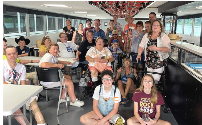
Amputee Activity: Valley Gem Sternwheeler Boat Ride in July 2022