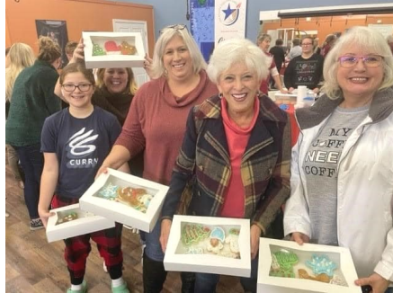
Cookie Decorating Class